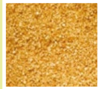
Demerara Sugar Colour: 2,200 Typical IU Crystals: 0.9 - 1.2mm

From sweetening cereal to adding texture to cookies, cakes, and desserts, it's versatility also means it can be used as a topping